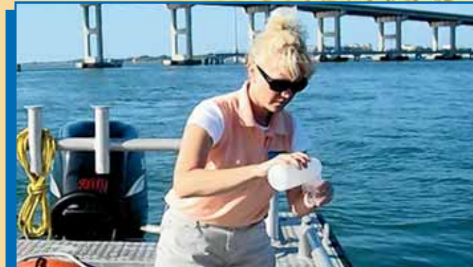
Routine river sampling is one of 22 environmental health programs.

Medical Special Needs Shelters Medical Reserve Corps Pandemic Influenza Bio Terrorism Emergencies Chemical Emergencies Radiological Emergencies Mass Casualty Events Hurricane & Natural Disaster Severe Weather Response Partnerships