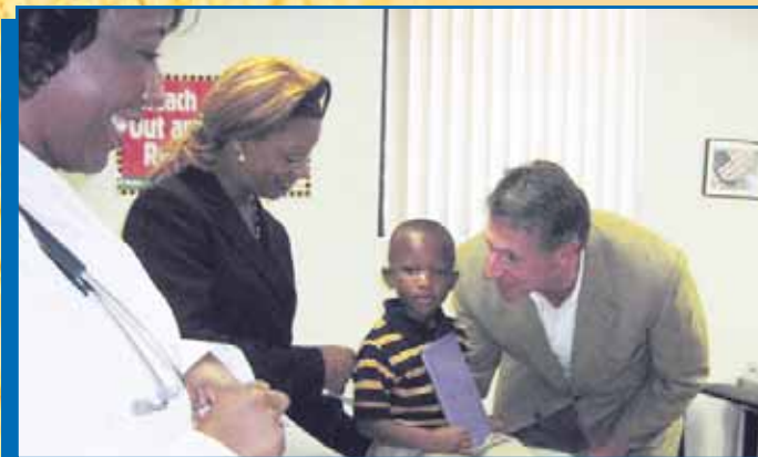
Congressman Tim Mahoney visits our well child clinic for the Reach Out and Read program.

The United Way Community Assessment of St. Lucie County noted that access to health care is an increasing problem. 25% of residents under age 65 do not have health insurance and many more are struggling to keep insurance coverage. In order to keep emergency rooms from being overburdened, we are evaluating ways to expand community health clinics and serve the health care needs of our residents.